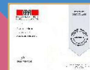
Akram Alam B.Tech. (ECE) – 2016 Digital Signal Processing from Ecole Polytechnique Fédérale De Lausanne, Switzerland